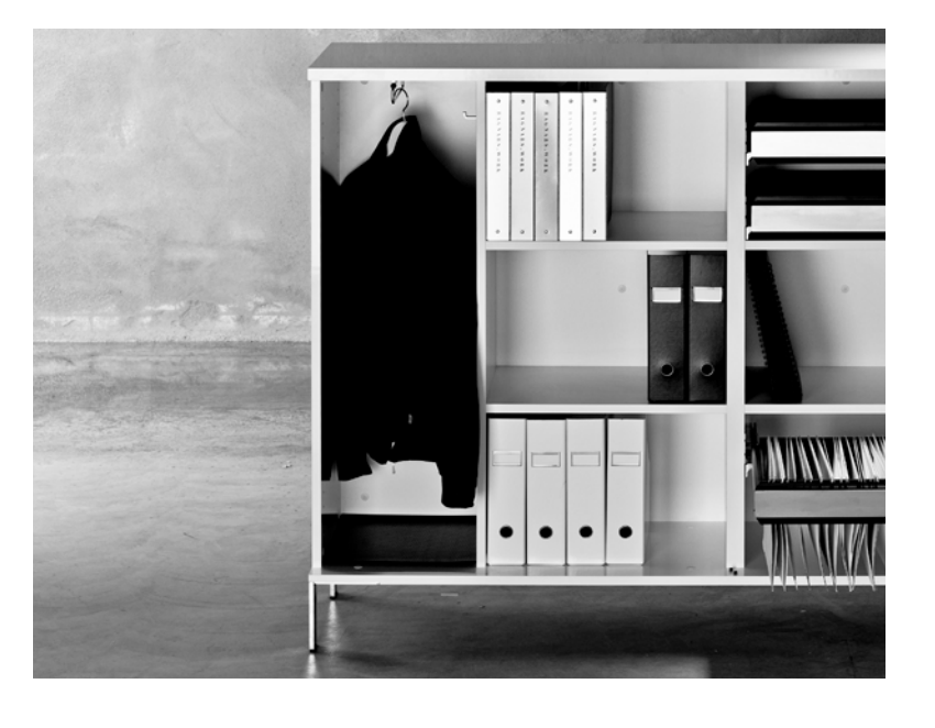
Another possible accessory is to have a wardrobe in cabinets with the height 3-B.