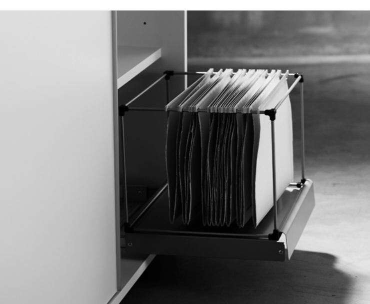
The Cabinet can also be equipped with Filing frames on expansions.

Cabinets can be equipped with a 3-drawers with a pen tray.