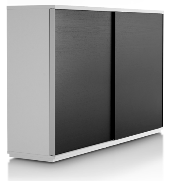
High pressure laminate white, Ash black steamed