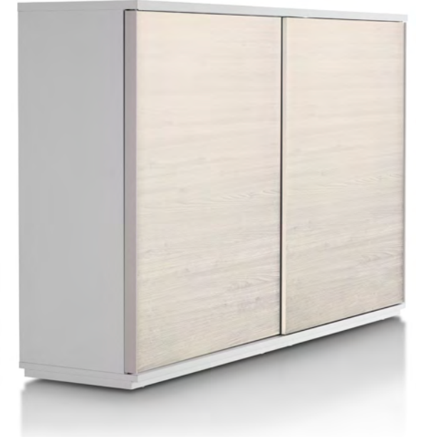
High pressure laminate white, Ash white steamed