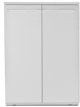
High pressure laminate white