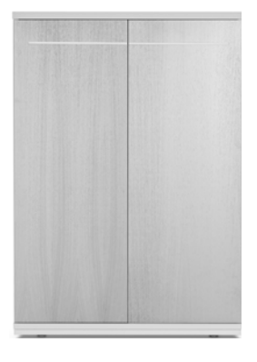
White steamed ash