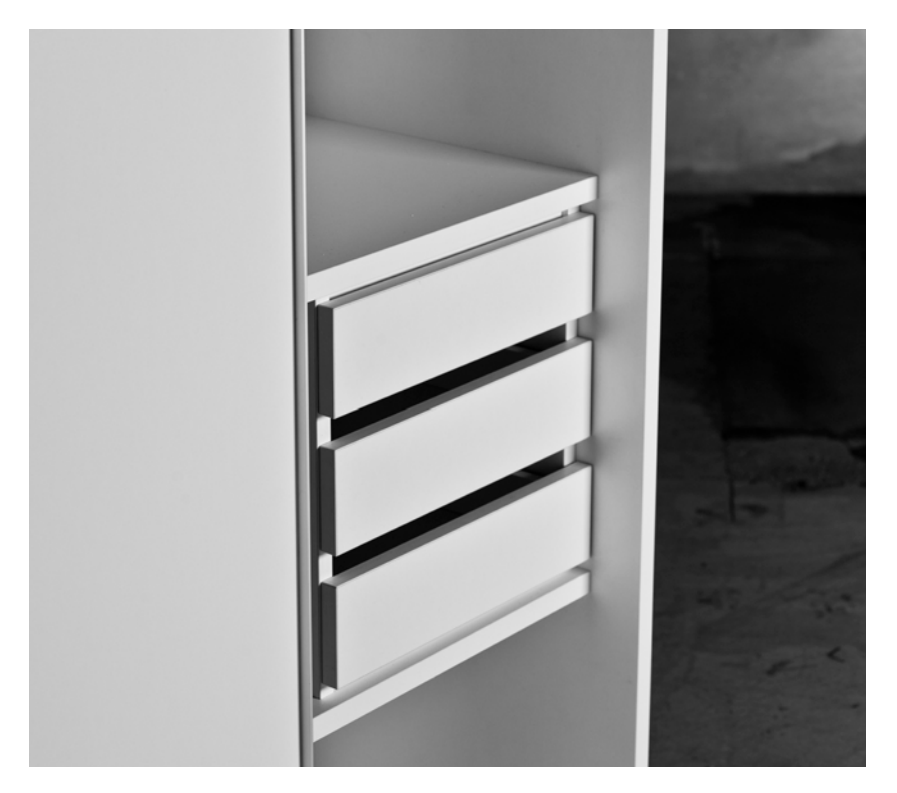
Cabinets can be equipped with a 3-drawers with a pen tray.