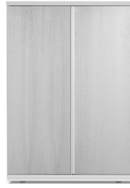
White steamed ash