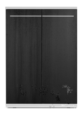
Black steamed ash