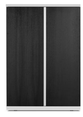
Black steamed ash