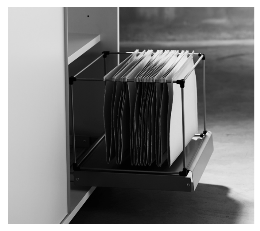
The Cabinet can also be equipped with Filing frames on expansions.