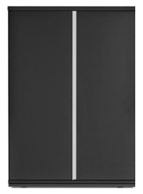
High pressure laminate black