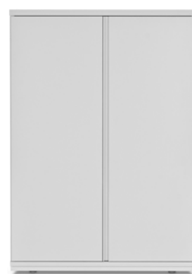
High pressure laminate white