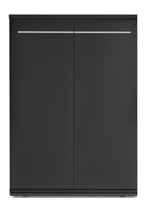
High pressure laminate black